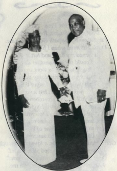
Back Together Again